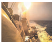
The Arleigh Burke-class guided-missile destroyer USS Carney (DDG 64) defeats a combination of Houthi missiles and unmanned aerial vehicles in the Red Sea in October 2023 in this file photo.

The Houthis are a rebel group financed, trained and supplied militarily by Iran, Israel's arch-enemy. They are also allies of Hamas and have been targeting Red Sea maritime traffic since November in