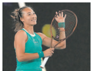
Zheng Qinwen reacts after defeating Oceane Dodin on Monday in Melbourne.

She'll next play No. 75-ranked Anna Kalinskaya. No. 50 Linda Noskova, who beat top-ranked Iga Swiatek in the third round, will meet No. 93 Dayana Yastremska.