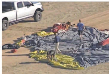
A hot air balloon crash in Arizona claimed the lives of four people and left one person injured.