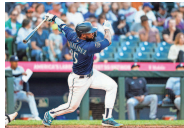
Outfielder Teoscar Hernandez hit.258 with 26 home runs and 93 RBI for the Mariners in 2023.

"Man, it's a dream come true," Penix said.