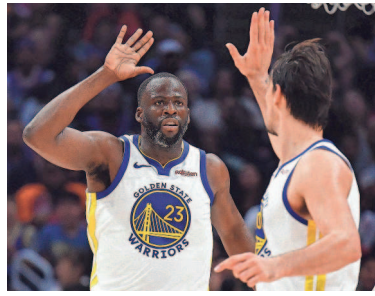
Warriors forward Draymond Green, left, is averaging 9.7 points, 5.8 assists and 5.5 rebounds.

"I was wrong," Green said of the incident. "I accept my fault in that, and I apologize... It brings pain. I have a wife, I have children, I have parents, I have grandparents, siblings,