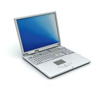
Online through ACCESS.wi.gov