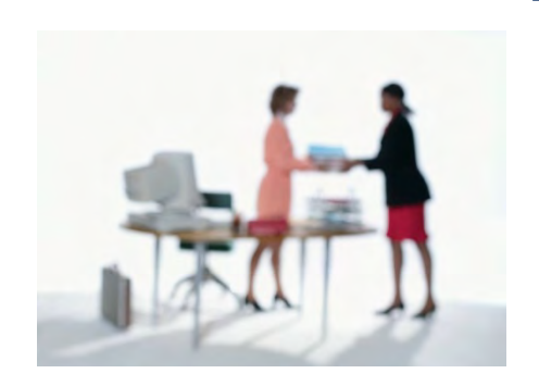
Walk-In (Face to Face)