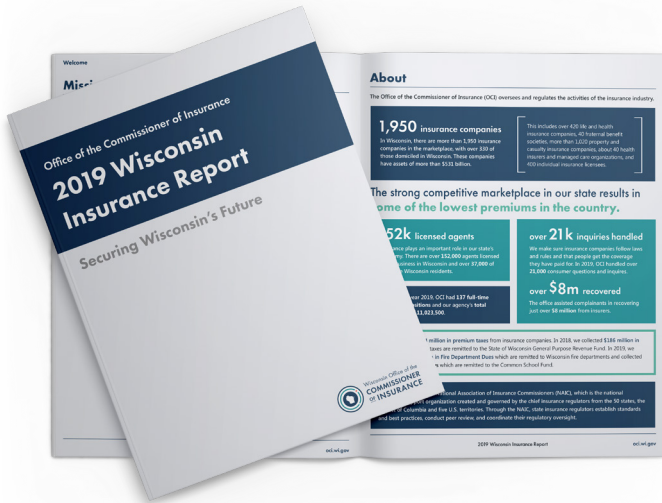
Wisconsin Insurance Report